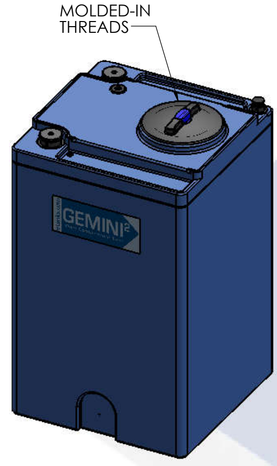
ISO VIEW ASSEMBLED